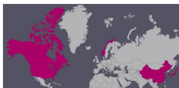
Water Magic SIU-High North 7 univ / 6 land 2016-2017 0.2M€