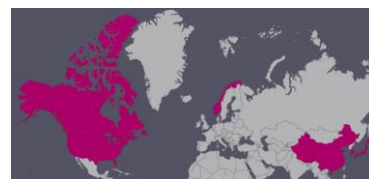
MEMPREX - NORPART 6 univ / 5 land 2017-2019 0.6M€