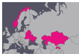
Water Harmony-I, 8 univ / 5 land 2011-2015 0.6M€