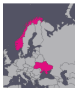
Bilateral discussions 2011