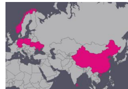
Water Harmony Erasmus+ 10 univ / 6 land 2015-2018 1.3M€