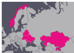
Water Harmony-II, 10 univ / 7 land 2015-2021 0.6M€