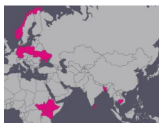
Water & Society- NORHED 11 univ / 8 land 2014-2018 4M€